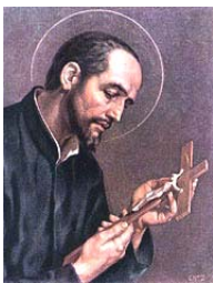
St. Anthony Mary Zaccaria Monday, July 5th

Second Reading: Paul proclaims that the cross of Christ makes all things new. The cross brings life, not death, for the cross transforms humankind's relationship to the world. Through the cross Paul was set free from the narrow constraints of worldly success and set free to live for Christ.