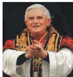
Pope Pius XVI (Peter's Pence)