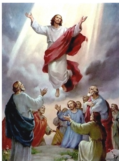
Ascension of the Lord Thursday, May 13th

The queen symbol was attributed to Mary because she was a perfect follower of Christ, who is the absolute "crown" of creation. She is the Mother of the Son of God, who is the messianic King. Mary is the Mother of Christ, the Word Incarnate... "He will be great and will be called Son of the Most High; the Lord will give Him the throne of His father David; and He will reign over the house of Jacob forever; and of His kingdom there will be no end" (Lk 1:32-33). Elizabeth greeted the Blessed Virgin, pregnant with Jesus, as "the mother of my Lord" (Lk 1:41-43). Mary is the perfect follower of Christ. The maid of Nazareth consented to God's plan; she journeyed on the pilgrimage of faith; she listened to God's Word and kept it in her heart; she remained steadfastly in close union with her Son, all the way to the foot of the Cross; she persevered in prayer with the Church.