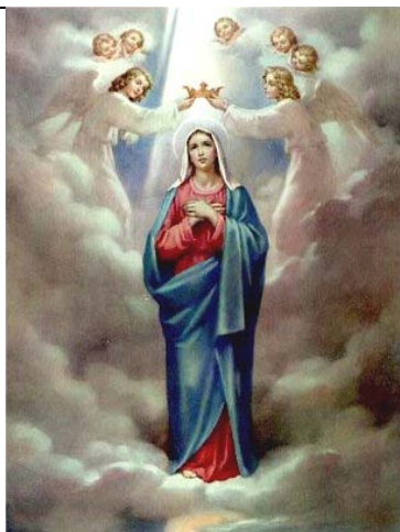
"O Mary, we crown thee with blossoms today!"

The queen symbol was attributed to Mary because she was a perfect follower of Christ, who is the absolute "crown" of creation. She is the Mother of the Son of God, who is the messianic King. Mary is the Mother of Christ, the Word Incarnate... "He will be great and will be called Son of the Most High; the Lord will give Him the throne of His father David; and He will reign over the house of Jacob forever; and of His kingdom there will be no end" (Lk 1:32-33). Elizabeth greeted the Blessed Virgin, pregnant with Jesus, as "the mother of my Lord" (Lk 1:41-43). Mary is the perfect follower of Christ. The maid of Nazareth consented to God's plan; she journeyed on the pilgrimage of faith; she listened to God's Word and kept it in her heart; she remained steadfastly in close union with her Son, all the way to the foot of the Cross; she persevered in prayer with the Church.