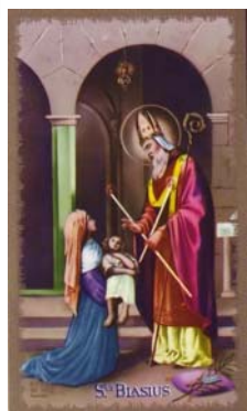
St. Blasé, Bishop, martyr Wednesday, Feb. 3rd

We are a worshipping, Eucharistic Community, united with the Holy Father, our bishop and our Pastor, to make Christ present in our world, through the Mass, and united in Him, to proclaim the Word of God in works of hospitality, charity, and mercy. We are committed to serving one another in the name of Jesus Christ, so that the Kingdom of God becomes more visible in our world today.