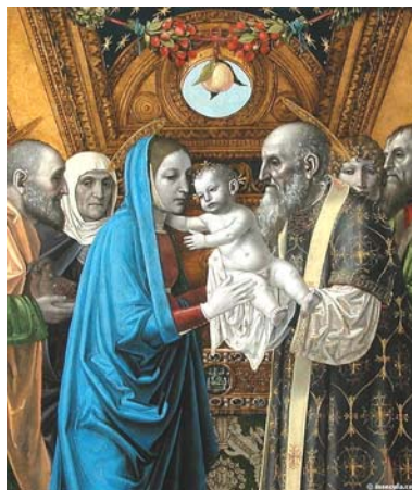
The Presentation of Our Lord Tuesday, February 2nd

Today's Gospel: Jesus is portrayed as a prophet whose message is despised and rejected by his own, and as a prophet whose life is protected from danger, as he walks through the midst of an angry crowd. Jesus challenged his own people with a message concerning the acceptance of God's word and the working of his power among foreigners and outsiders. As Jesus' own community, let us rejoice when non-Christians live in goodness and truth, and let us ask for greater openness to God's word in our own lives.