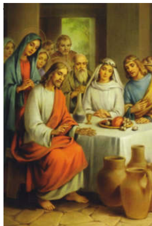
The Wedding Feast At Cana