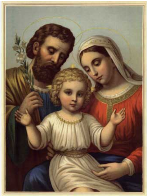
The Holy Family of Jesus, Mary, and Joseph

This liturgical feast has been on the Church calendar about a hundred years, often on different dates. It is a "devotional" or "idea" feast that was inaugurated by Holy Family associations. Everything we know about the Holy Family, which is not much, comes from the Gospel accounts read over the three years. It celebrates the unity and love so evident in the family of Joseph, Mary, and Jesus.